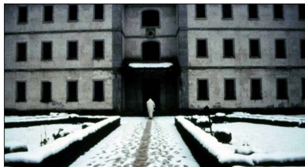
Die große Stille.