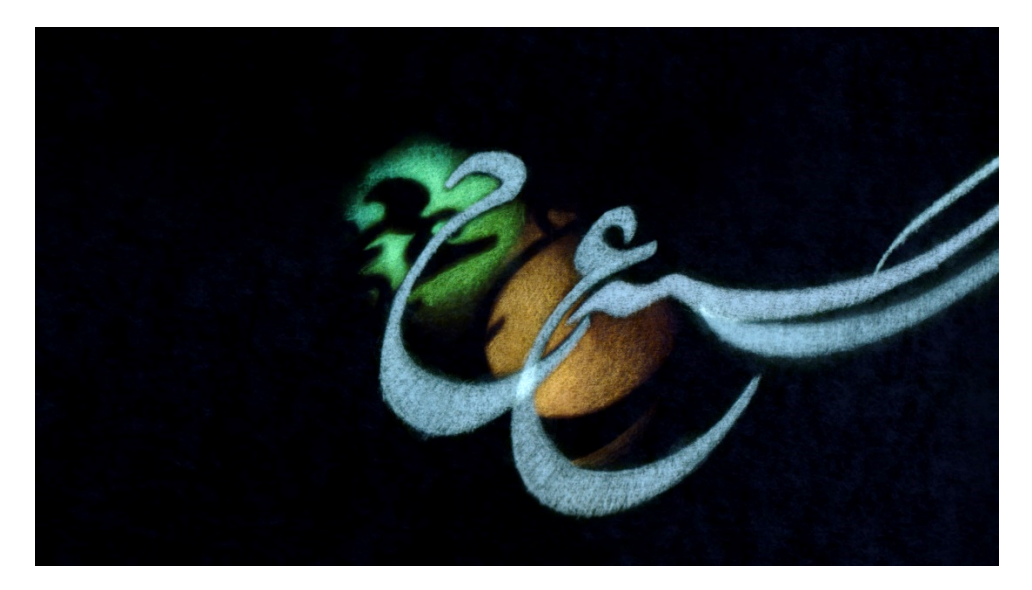
Figure 2: Mohammad Javad Khajavi, The Third Script (2017), animated short film.

While these kinds of collaborative performances have become more popular in recent years, the possibility of creating audio-visual interactions by means of such time-based media as animation and film has opened up an entire new vein of artistic opportunities for interactions between calligraphy and music. Clearly inspired by the musical analogies used in describing Islamic calligraphy, a few artists have already embraced the medium of animation to create calligraphic visual music pieces. One example of this is a short animated film entitled The Third Script (2017).<sup>46</sup>