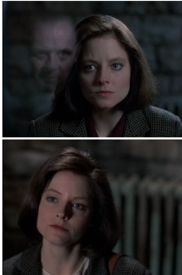
The Silence of the Lambs.

That the two characters are more closely related than is immediately apparent is also suggested by the “twinning” strategy evident in Silence’s first interview sequence, in which the characters meet. Parallels are immediately established between the two through a subtle formal symmetry: shots alternate between their respective point of views, and the characters perform strikingly similar actions whilst placed in the same positions within the frame. Curiously, the two are never framed in a two-shot together throughout the entire film (with the exception of that brief touch of fingers in their last scene), and their faces are joined but once in the glass partition that separates them. The potentially reflective nature of their relationship is thus underlined. The unsettling suggestion is that some unnamed quality belonging to Clarice is brought out by and mirrored within the image of her mentor-nemesis. 33