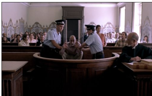
Fig. 1: As Bodas de Deus .

A confusão está instalada: a audiência no tribunal desata a rir, como ri também o espectador do filme. O juiz bem se esforça por manter a ordem batendo energicamente com o seu martelo e disparando com a ameaça de “mandar evacuar na sala”, um infeliz lapso de linguagem, com certeza... Mas de nada lhe serve a sua desesperada tentativa de afirmação de força, pelo contrário, isso só contribui para aumentar o ridículo e confirmar aos olhos de todos a artificialidade e a fragilidade da sua autoridade — autoridade é aquilo que não se vê, uma realidade que depende do consentimento do outro para existir. Antes que dois polícias se aproximem de João de Deus para o levar para fora da sala, ele ainda tem tempo de se pôr de cócoras em cima da cadeira e oferecer os dois dedos médios ao juiz (fig. 1).