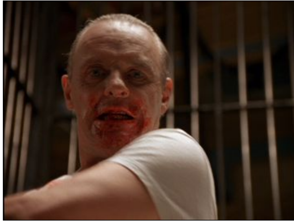
The Silence of the Lambs.

This imaginative reconstruction of the attack attributes to his violence an archetypal, almost mythic dimension. However suave and attractive he appears, such moments suggest that he is a figure that we must look upon with some measure of awe. And if we are to find a kind of dark majesty in Hannibal's unfettered savagery, then our typical moral attitudes towards murder are subjected to a reevaluation. Lecter commands fear, and fear is too primal an emotion to be assuaged by dressing up the bogeyman in gentleman's clothes. In fact, such a strategy can only make a monster more terrifying as it crawls from beneath the bed, straightening its mask of civility. The attraction of monsters is mesmerizing — they draw energy from the language-denying emotion that grips their victims upon their revelation. Such a moment is akin to staring into a solar eclipse, or being drawn into the orbit of a black hole. Etymologically, monstrum is "that which reveals, or warns," and when Lecter's true face emerges in moments of violence it is the revelation of a terrifying godhead.