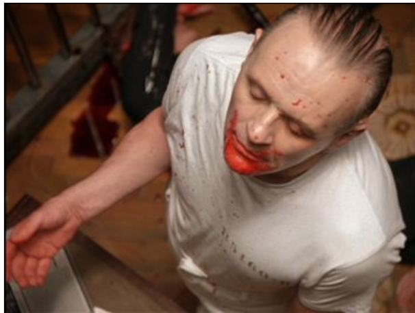
The Silence of the Lambs.

It is debatable whether or not we should attribute this reflexive moment of overt stylisation to the narrational agency of Clarice. On the one hand, this formal manipulation might be an attempt to represent her imaginative reconstruction of the event, in which case, the final reaction shot of her troubled face cues our analogous response. On the other, it is more interesting to entertain the possibility that these strategies issue from a much more disturbingly ambiguous position within the narrational discourse. It is as if an unnamed narrator who sought to glorify the represented actions briefly directed the narration. The narration of violence is remarkable here because it seems to transcend the rules of the game in two important regards: 1) like the beating of Sgt. Pembrey in Silence , Lecter's expression suggests a demented pleasure in his actions; and 2) it is the only sequence in the entire series that does not provide or imply a motive behind Lecter's assault. Certainly his victims have done nothing to warrant the savageries to which they are subjected, and the violence visited upon them seems to exceed the bounds of the perverse moral "logic" discussed above. And yet, these sequences are somehow not forceful enough to guarantee the effective disruption of any allegiance we may have formed with the character. Therefore, the narrational strategies employed here do not problematize our allegiance with Lecter, but actually seek to strengthen it.