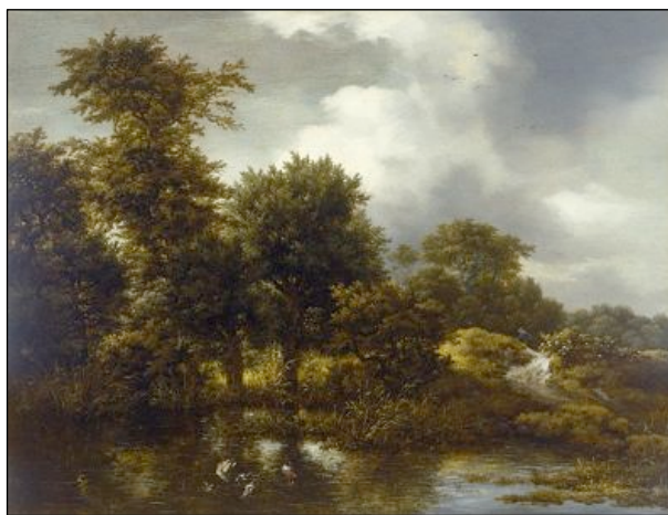
Jacob van Ruisdael, Paysage forestier avec étang (c. 1640). Musée des Beaux Arts de Houston.

Si Dans la brume accuse un style spirituel incontestable, c'est aussi grâce à la façon dont Loznitsa filme la nature et la relation de l'homme dans la nature. Dans sa déclaration sur le film, le réalisateur dit qu'il souhaitait représenter la forêt mystérieuse, comme dans les tableaux de Jacob van Ruisdael. 36 L'œuvre de ce peintre néerlandais du XVII e siècle consiste surtout en la représentation de paysages orageux, renforçant ainsi le dramatisme de la réalité.