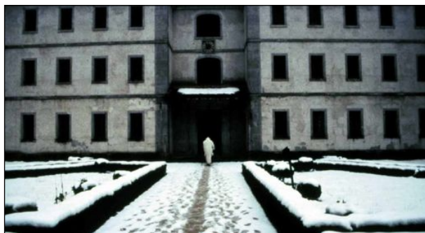
Die große Stille.