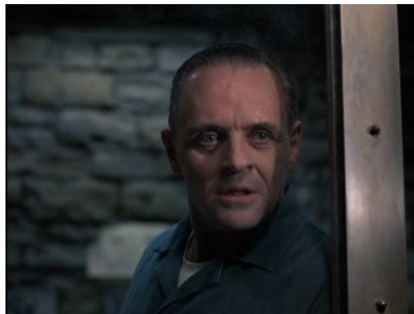
The Silence of the Lambs.