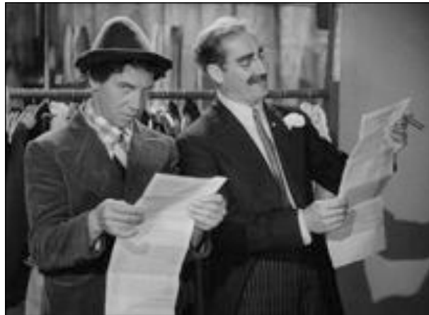
A Night at the Opera.

GROUCHO: I wouldn't know about that. I haven't been in Canada in years. Go ahead and read it.